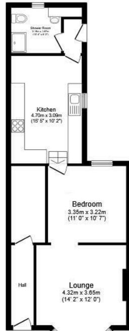
Floor Plan Floor area 57.2 sq.m. (616 sq.ft.)

Total floor area: 57.2 sq.m. (616 sq.ft.)